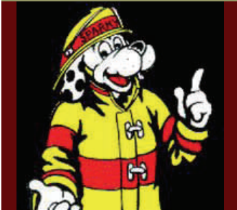
Sparky the Fire Dog® is a registered trademark of the NFPA.